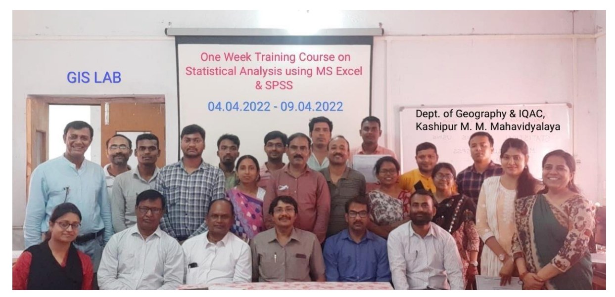
Workshop on "MS Excel and SPSS" 2022