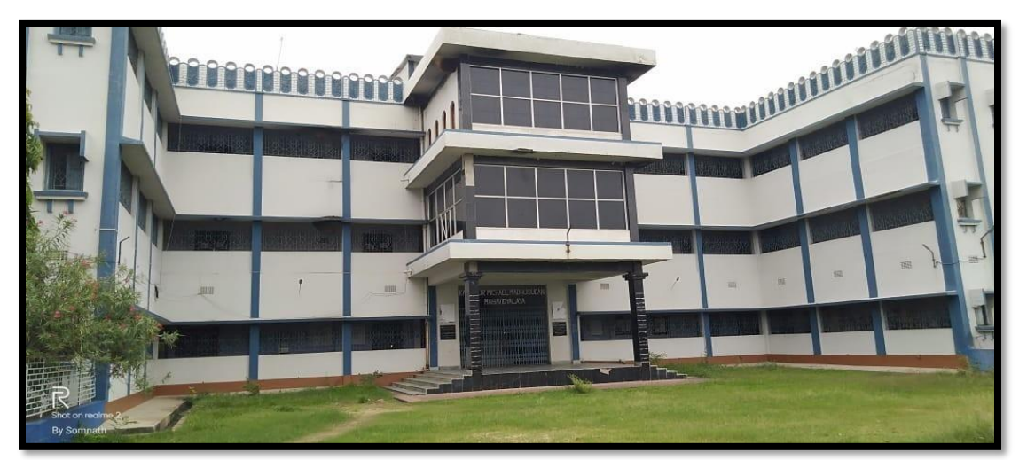
Main Building of the College