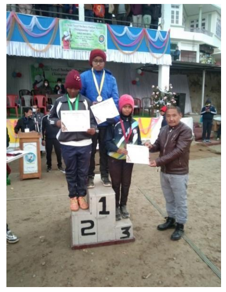
Our student hold first position in Archery Competetion