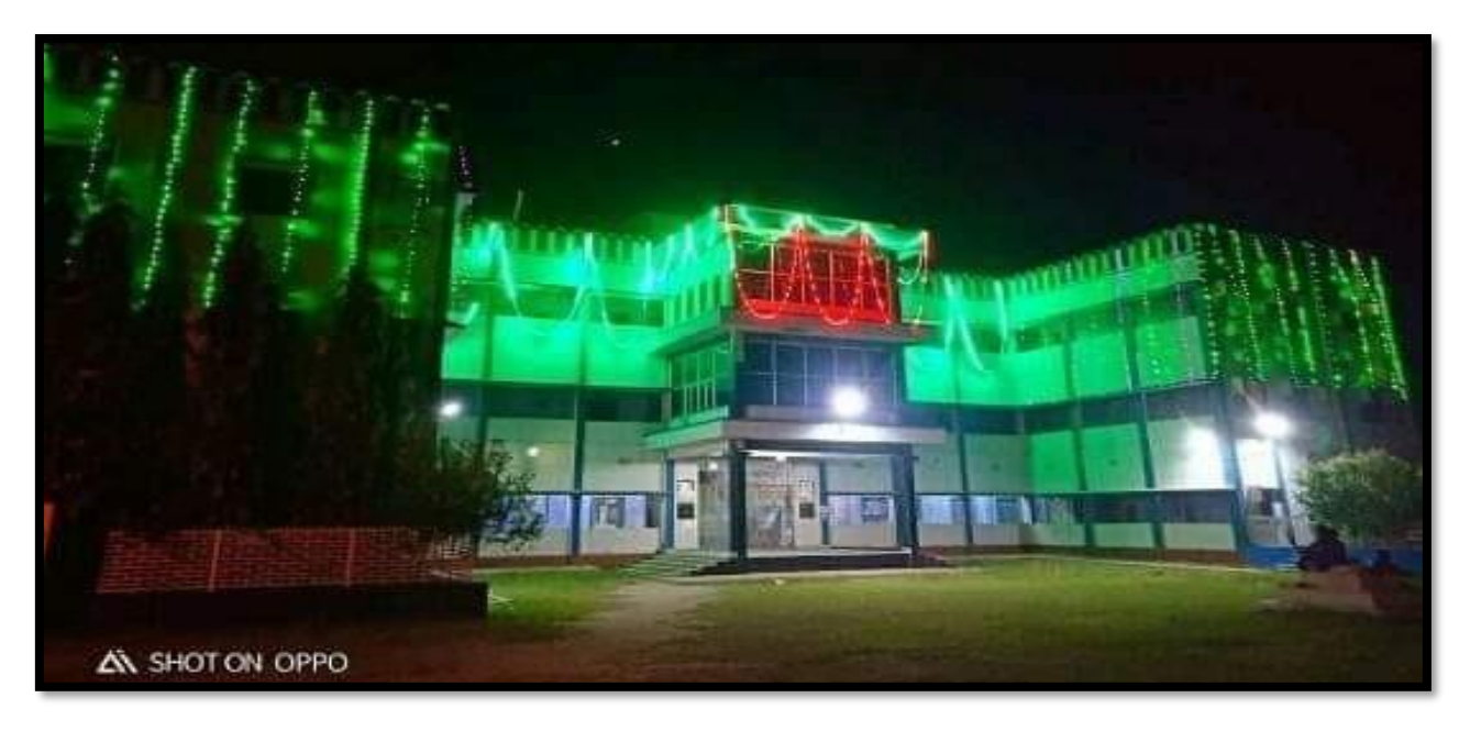
Enlightening Night View of the College during International Seminar in 2018