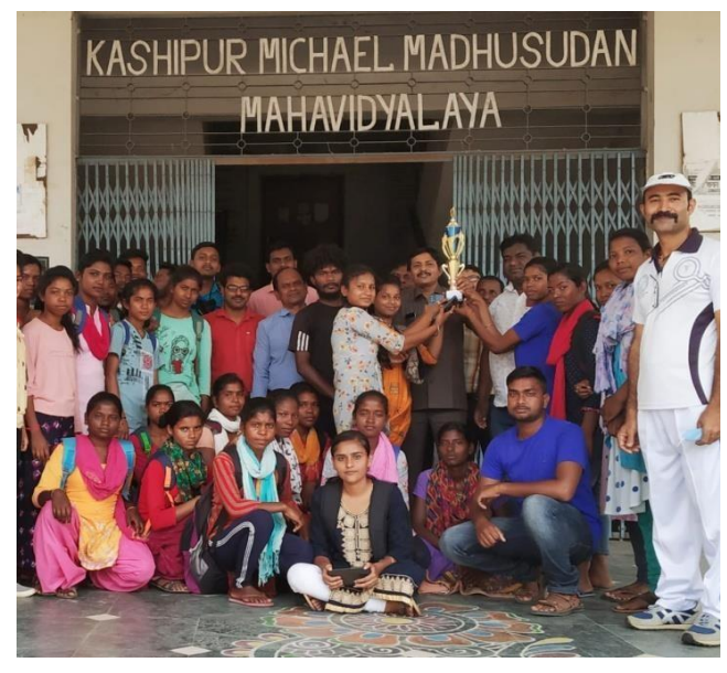
College Women Team champion in 'KHO-KHO'