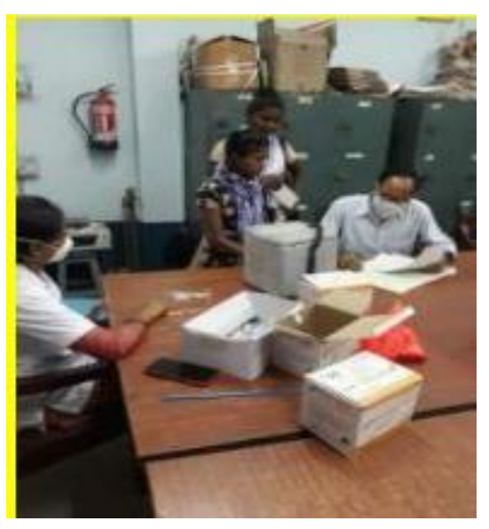
Vaccination Programme in our College