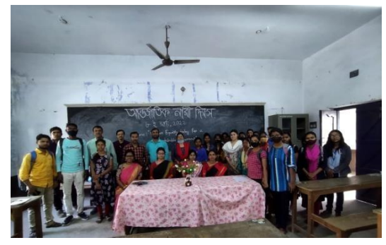
Women's Day Observation 2022